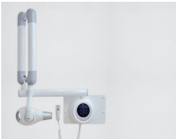
4. The quick solution - VistalIntra DC