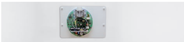
3. Simple installation of the adapter plate and electronics for the VistalIntra DC