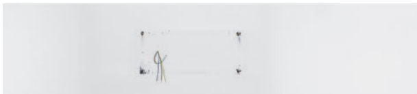
2. Old device removed