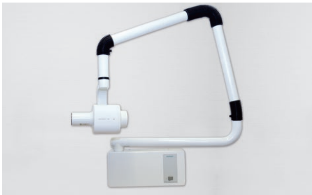
1. Sample old device