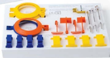
Image plate and film holder system Set Color