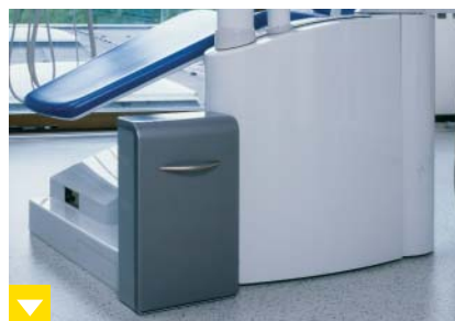
CS 1, CAS 1 and CA 1 can be used externally in the practical housing.

3 Separation rates measured by the TÜV [technical monitoring authority] Essen in accordance with the German standard test at maximum rate of fluid flow