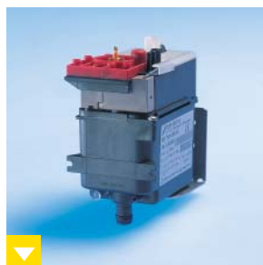
Rinsing unit for producing a fine film of water that protects the separation machine from deposits.